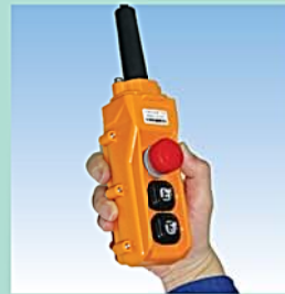
Push button switch