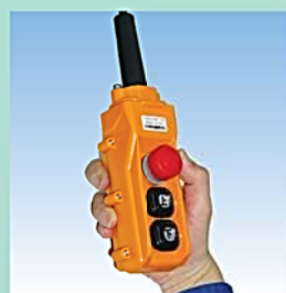
Push button switch